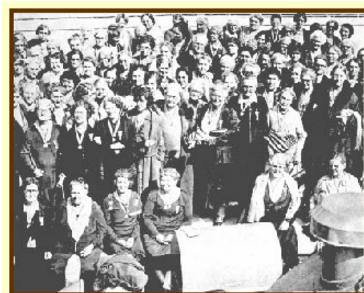
Image of Gold Star Mothers

But our country has a history of turning a blind eye to tragedy.