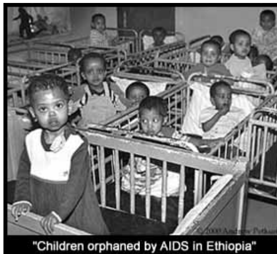
Image of Ethiopian orphans