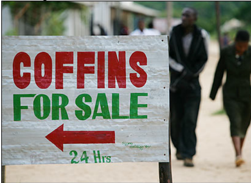
Image of Coffins for sale sign

What has this type of decision brought Africa?